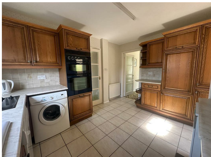
Kitchen 12'05" x 10'0" (3.78m x 3.05m)

Double glazed window, work tops with a range of cupboards and drawers, inset ceramic sink unit, inset electric hob, electric oven, plumbing and space for washing machine and dishwasher, boiler, integrated fridge.