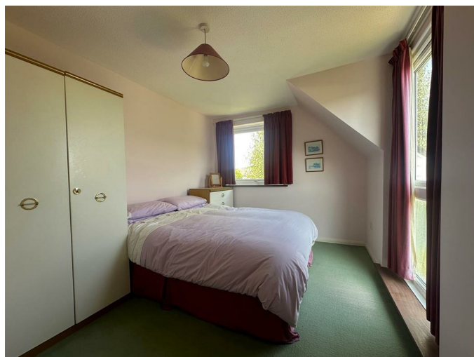
Bedroom Two 12'10" x 10'01" (3.91m x 3.07m)

Dual aspect double glazed windows, radiator, fitted bedroom furniture.