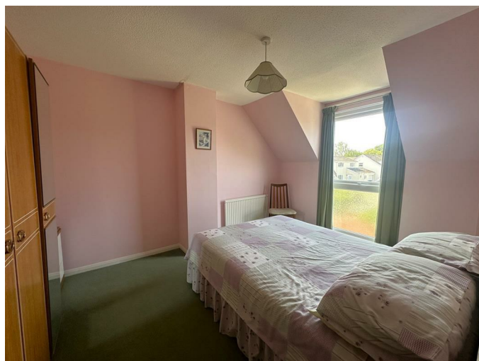
Bedroom Three 12'07" x 8'11" (3.84m x 2.72m)

Dual aspect double glazed windows, radiator.