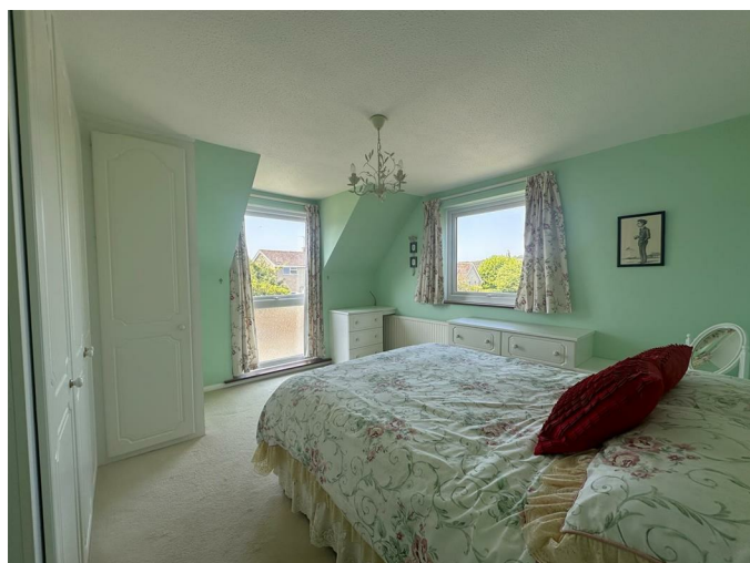
Bedroom One 12'10" x 12'07" max (3.91m x 3.84m max)

Dual aspect double glazed windows, radiator, fitted bedroom furniture.